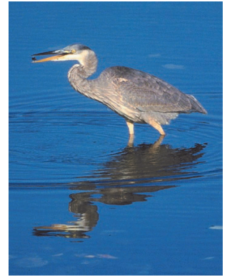
"Great Blue Heron" By L. Gooch